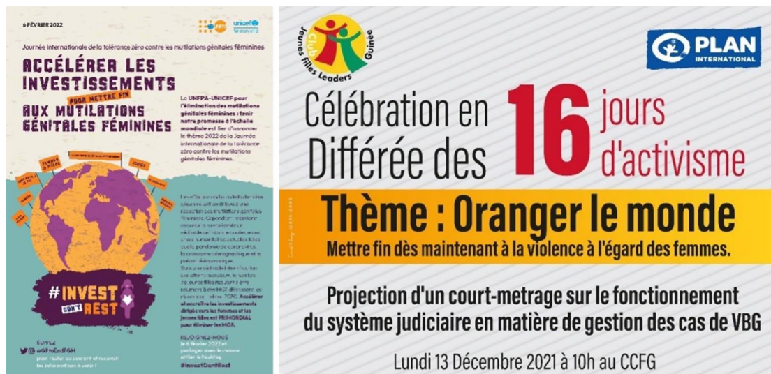
On the left, artwork shared via the Twitter account @unfpa_guinea on 18 January 2022 in the run-up to the International Day of Zero Tolerance against Female Genital Mutilation. On the right, artwork distributed on social media on the occasion of the 16 days of Activism against gender-based violence.

and for 8 March, International Women's Day. These campaigns often combine a variety of awareness-raising tools such as public speaking engagements, artistic and sports performances, film screenings 129 and awards. 130