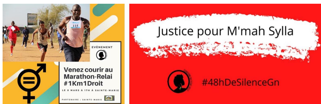
Artwork shared by Guinéennes du 21e siècle

Alongside the global campaigns that are echoed and implemented in Guinea at the initiative of certain diplomatic representations and UN agencies, Guinean activists have, in recent years, wished to reclaim the initiative of running awareness campaigns. The Guinéennes du 21e siècle collective, 143 founded in 2016, for example, wanted to “dust off this folkloric and exclusive way” 144 of celebrating International Women’s Day. Since 2017, it has organized a symbolic marathon, “1 km, 1 right” to invite Guineans “to come and run for the rights of their fellow citizens and in order to symbolically reproduce the kilometres covered by these women daily”. 145 Driven by the young age of its members, the collective has also raised awareness on social media. After the death of M’mah Sylla, they called for a “symbolic digital #BlackOut from 21:00 GMT this Sunday, 21 November”, which consisted of changing their profile picture to a red background and refraining from publishing anything on social media unless related to M’mah Sylla for two days.