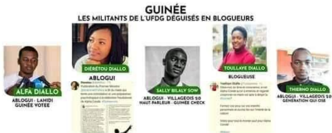
☺ ↑ Montage of text and photos posted on social media presenting bloggers engaged in defending human rights as “undercover” UFDG activists

In addition, between 2019 and 2021, human rights defenders were often stigmatized, as were members of civil society and opposition parties, when they denounced human rights violations committed by the authorities, and they suffered severe repression: bans on demonstrations, protesters killed and arbitrary detentions. 179 In 2020 and 2021, communicators from the ruling RPG party tried to denounce “activists from the UFDG [the main opposition party] disguised as bloggers” and “UFDG supporters disguised as journalists” in text and photo montages (see below). The names and photos of some of them were published on social media along with screenshots of their posts supposedly proving their alleged sympathy for the opposition party. Among them were journalists and bloggers who had been involved in combating violence against women for several years, whether through the Association des blogueurs de Guinée (Ablogui), the Collectif guinéenne du 21e siècle aimed at “improving the conditions of Guinean life” 180 and the news website Guinée matin.org .