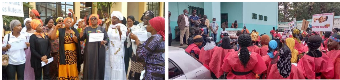
© ↑ Left, protest in front of the Department of Defence on 12 December 2019. Right, Protest in Nzérékoré on 30 November 2021 following the death of M'mah Sylla © Agir pour le Droit Féminin

The authorities reacted again to these tragic cases and to the mobilization of civil society. On 15 December 2021, the Prime Minister signed a “written commitment to end gender-based violence (GBV), including rape”. 54 This document also set a goal of reducing the rate of FGM by 10%. 55 The Minister of Security pledged that “the police will fight this scourge effectively and ensuring that the heaviest penalties will be applied to criminals who perpetrate these acts”. 56 Finally, on 13 January 2022, a memorandum from six national NGOs –forming the Women's Collective against Sexual and Obstetric Violence– was submitted to the Prime Minister, “calling on the authorities to scale up the fight against gender-based violence and the unconditional application of the law in order to punish these crimes of rape as well as harmful medical practices in our country”. 57 The Prime Minister assured the public at this time that “you will not find any barriers on our side, we are ready to listen to you and support you”. 58