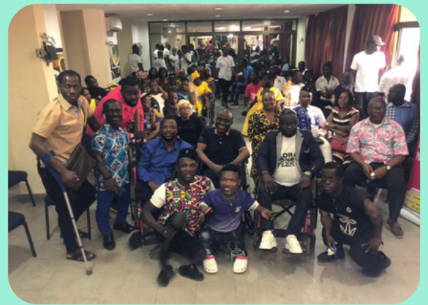
Action et Humanisme Cote d'Ivoire

Funded by FON, this project serves 32 disabled people: 29 women and 3 men in the first phase. They took part in a training workshop on January 9, 2024, at the Maison des Jeunes de Yopougon, on economic empowerment.