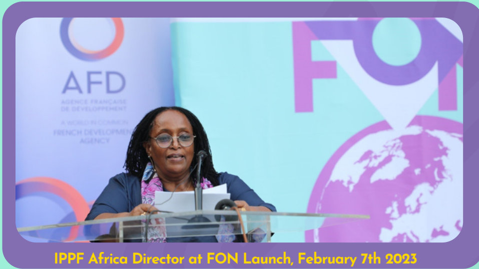
IPPF Africa Director at FON Launch, February 7th 2023

For a world free of Gender-Based Violence