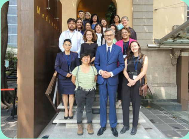
FON-Selected CSOs in Mexico with French Ambassador