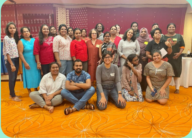
CSOs in Sri Lanka who participated in the program

In October 2023, CREA marked a significant milestone by initiating FON's inaugural capacity-sharing program with Civil Society Organizations (CSOs) from Sri Lanka. The training program, titled 'Feminist Approaches to Project Design,' represents a transformative step towards fostering awareness and challenging gender biases, power imbalances, and social injustices inherent in conventional project design processes.