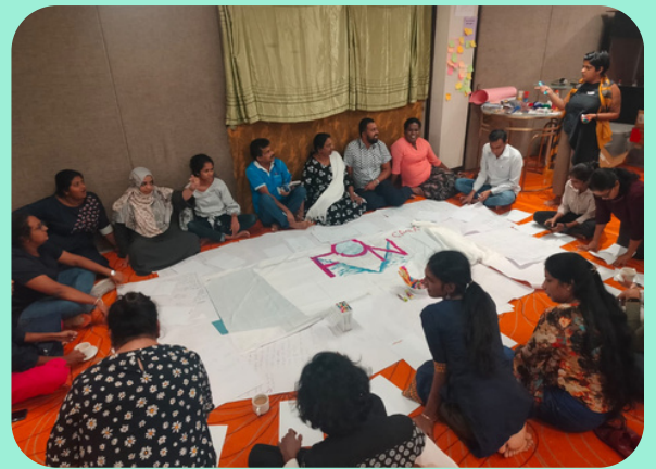
FON-Selected CSOs in Sri Lanka

This forward-looking endeavor underscores FONs commitment to promoting a more inclusive and equitable world through capacity-sharing initiatives that transcend borders. We look forward to witnessing the transformative impact of these feminist approaches as participants take them forward in their advocacy and project design endeavors.