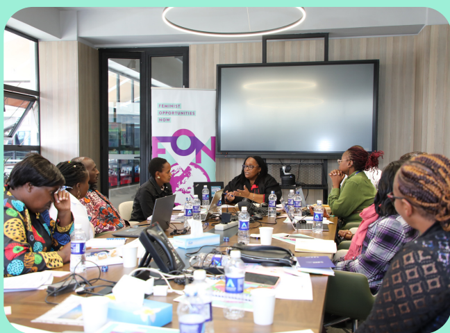
Inception Meeting between Fon CSOs in Kenya with FON team

The incubation program aims to help CSOs adopt an entrepreneurial approach and enhance financial sustainability through a 5-month initiative. CSOs will undergo monthly remote training, receive coaching, and access technical consulting. A 3-day in-person seminar in June in Abidjan, Côte d'Ivoire, will further strengthen their collective power.