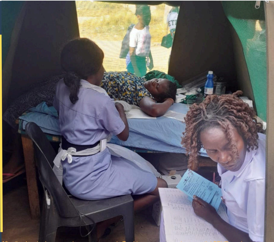
After the door-to-door campaign, more women in Zambia are now accessing essential SRHR services.

"The door-to-door strategy proved to be a powerful and effective approach for increasing access to FP services at the community level, as it gave women the privacy and space to ask questions they would never raise in public," reflects one health worker involved in the campaign.