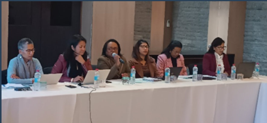
The first WISH 2 Country Steering Committee meeting is under way, bringing together partners to strengthen collaboration and advance SRHR priorities.

On 5 June 2025, Antananarivo hosted the inaugural meeting of the WISH 2 Country Steering Committee, chaired by the Ministry of Health. The session brought together a wide range of stakeholders including Parliamentarians, and line ministries, who had also been part of the WISH2ACTION initiative.