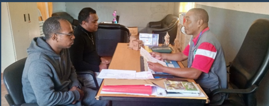
Courtesy visits with regional health officials focused on assessing government health facilities.

In addition to this first CSC meeting, courtesy visits were conducted with regional health officials in June and July. These visits aimed to carry out facility assessment of government health facilities and to introduce the new regional WISH 2 staff members.