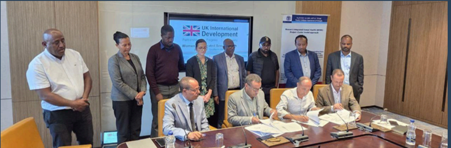
A MoU was signed between WISH 2 partners and the Ministry of Health to strengthen SRHR in Ethiopia.

In June 2025, FGAE officially launched the WISH 2 project at both national and regional levels in Addis Ababa and across the project regions of Tigray, Afar, and Amhara.