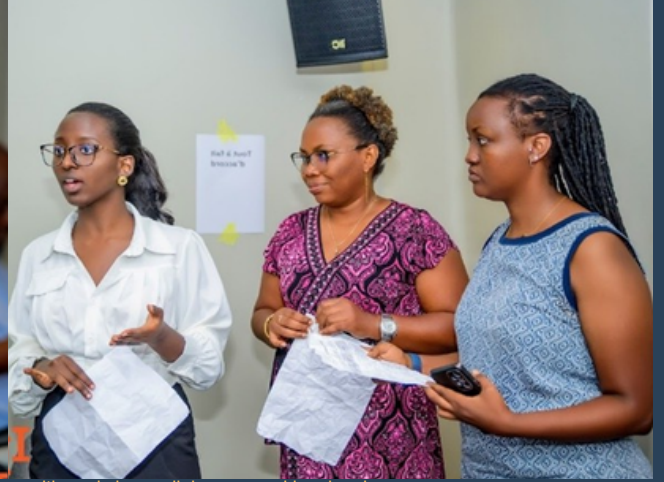
Through WISH 2, Ipas is empowering 27 key actors in Burundi to drive SRHR change with workshops, dialogues, and legal review.

In Burundi, where sexual and reproductive health remains highly sensitive, Ipas Burundi is driving transformative change through the WISH 2 project, funded by the UK's FCDO. By strengthening civil society engagement and championing rights-based approaches, Ipas has empowered 27 key actors through VCAT workshops, multi-stakeholder dialogues, and legal reviews.