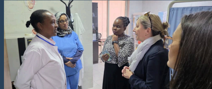
FCDO and IPPF delegates visit Romanat Clinic in Tigray.